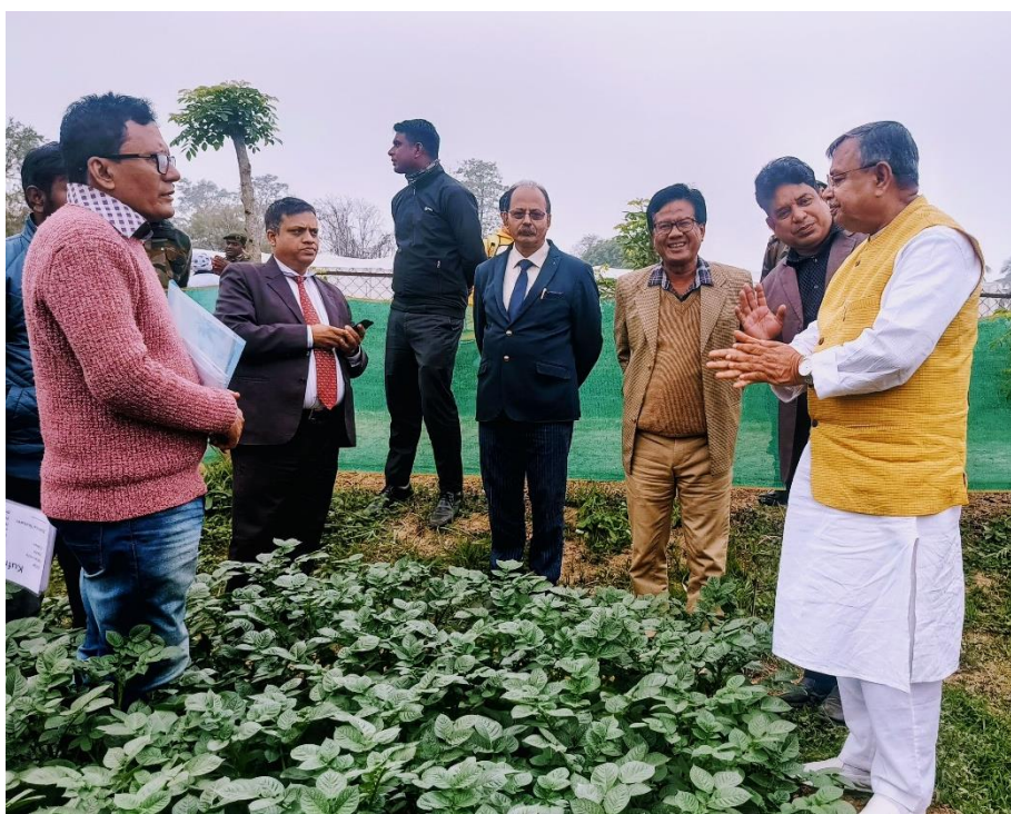
Photo: The Hon'ble Vice-Chancellor of TIUT interacting with Shri Ratan Lal Nath ji, Hon'ble Minister.