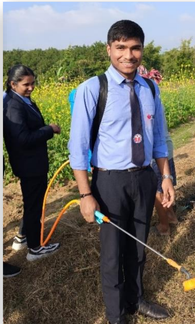
Photo: Students of the School of Agriculture at Nagicherra Research Complex for extension activities