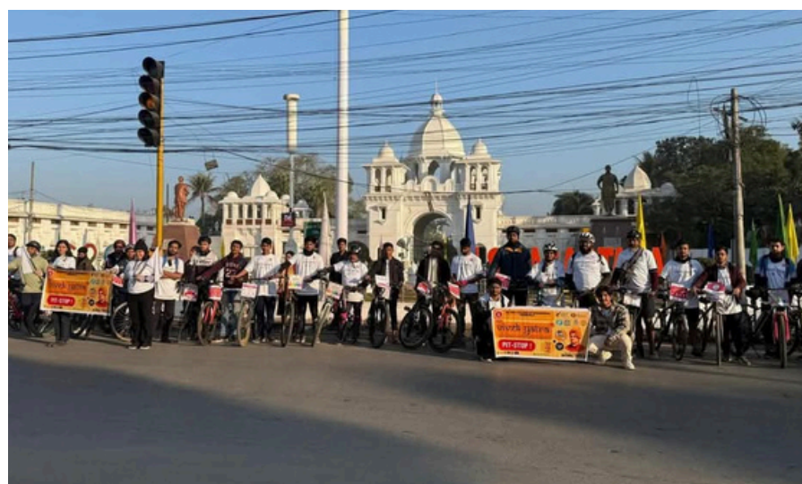
Students and Faculty from TIUT & TCEA participates in the rally