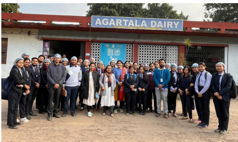
Students along with the faculty members of TIUT at Agartala Dairy.