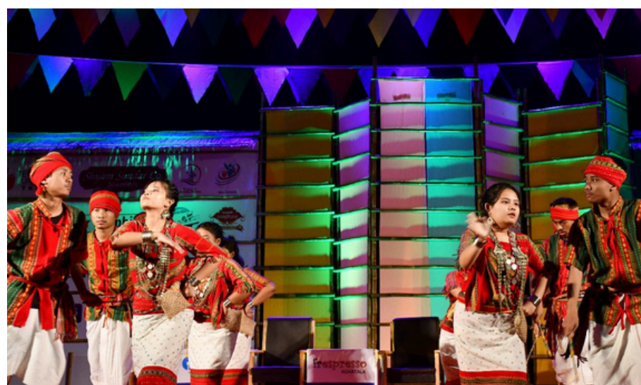
"Lebang Bumani" by the students of TIUT.