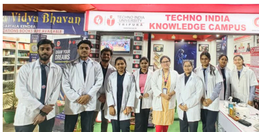
Students members with the faculty members of the Free Health Checkup Camp.

On 11th January 2025, Techno India Knowledge Campus organized a Free Health Camp during the 43rd Agartala Book Fair, offering free health check-ups and medical consultations to visitors. The initiative was led by students from the Departments of Microbiology and Biotechnology, whose active participation contributed to its success and positive public reception.