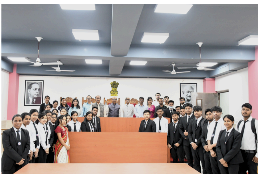
Students of LAW Dept. along with the faculty and the esteemed guests.