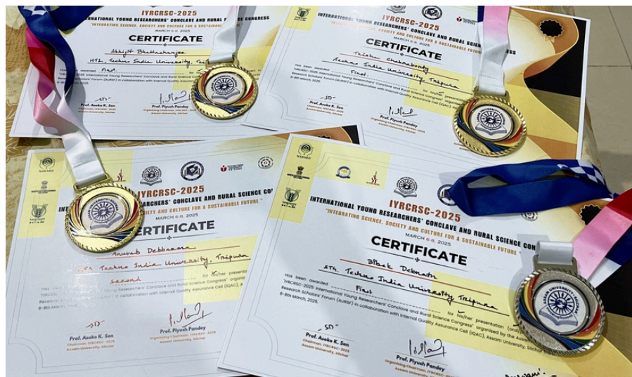
Laurels won by TIUT students and faculty.

TIUT won 3 Golds and 1 Silver at Assam University's IYRCSC-2025, with winners including UG students and a faculty member. Competing against PG and PhD scholars, their success highlights TIUT's excellence in research, mentorship, and interdisciplinary academic engagement.