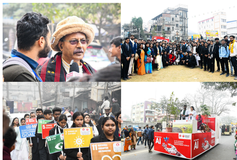
Moments from the participation in the rally on Parakram Divas