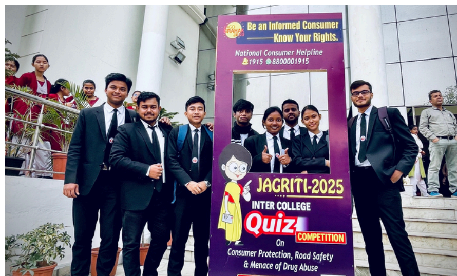
Students from TIUT at Jagriti 2025.

With themes focused on Consumer Protection, Road Safety, and Drug Abuse Prevention, our teams demonstrated impressive knowledge and team spirit.