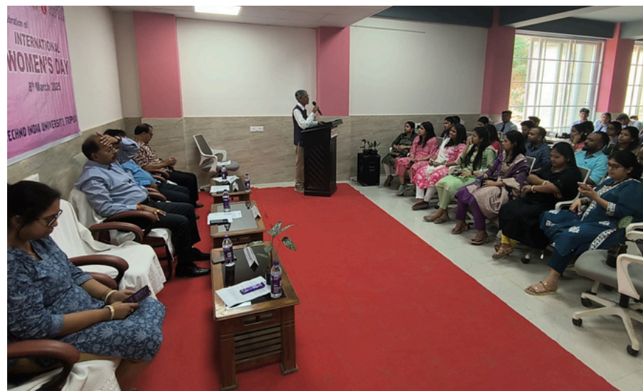
Celebration of Women's Day at TIUT.

Techno India University, Tripura, marked Women's Day with thought-provoking discussions, cultural performances, and felicitation of women staff. Events highlighted gender inclusivity, leadership, and women's contributions, inspiring the campus community and reinforcing TIUT's commitment to empowerment and equality.