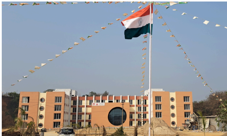
Flag hosting at Techno India Knowledge Campus