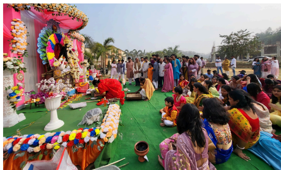
Moments of Saraswati Puja Celebration at Techno India Knowledge Campus