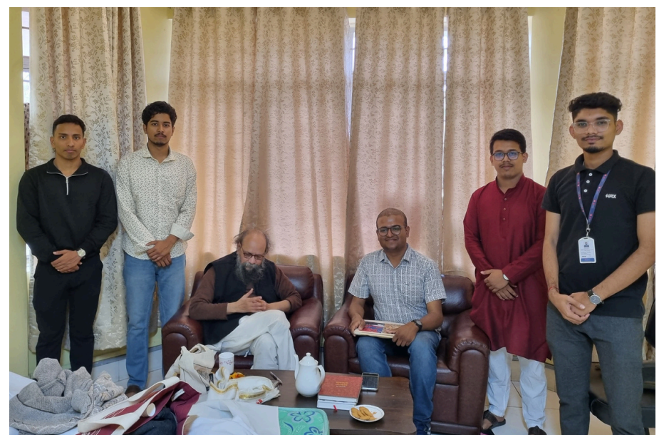
Moments during the interview of TIUT with Eminent Poet Joy Goswami.

During the Tripura Literature Festival 2025, Techno India University, Tripura, conducted an insightful interview with renowned Bengali poet Joy Goswami. The conversation delved into his poetic philosophy, the emotional landscapes of his work, and the enduring relevance of poetry in today's socio-cultural context.