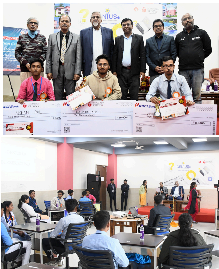
Moments of Genius 1.0 organized by TIUT.