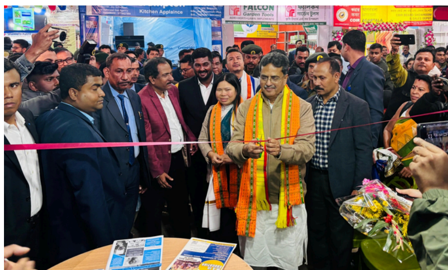
Inauguration of Techno India Knowledge Campus stall by the Chief Minister on 35th Industries and Commerce Fair 2025.

On 29th January 2025, Hon'ble CM Prof. (Dr.) Manik Saha inaugurated the Techno India Knowledge Campus stall. Showcasing innovation and academic excellence, the event reflects TIKC's industry-academia synergy. Grateful to Hon'ble Chancellor and Vice Chancellor for their support and visionary leadership.