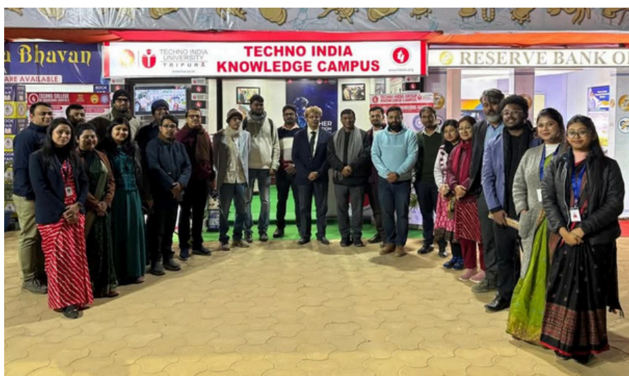
Various faculties from TIUT and TCEA along with the Vice-Chancellor (TIUT) & Principal (TCEA)