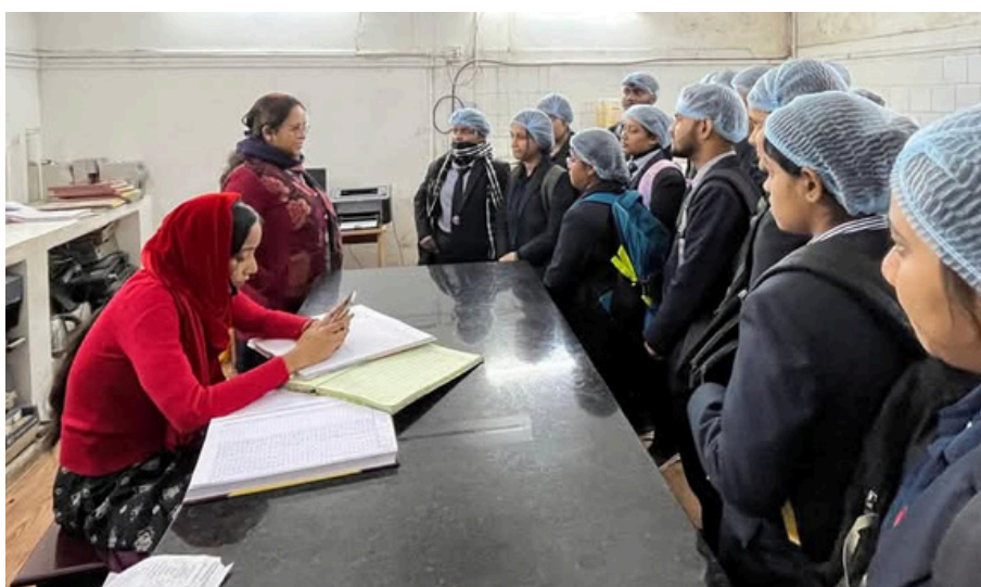
Students interacting with instructors of the factory.

On 2nd January 2025, students from the Departments of Biotechnology, Microbiology, and Bio-Engineering at Techno India University, Tripura, embarked on an educational industrial visit to Gomati Cooperative Milk Producer Union Limited, Agartala. The objective was to provide students with hands-on exposure to bioprocessing technologies, aligning classroom learning with real-world industry practices.