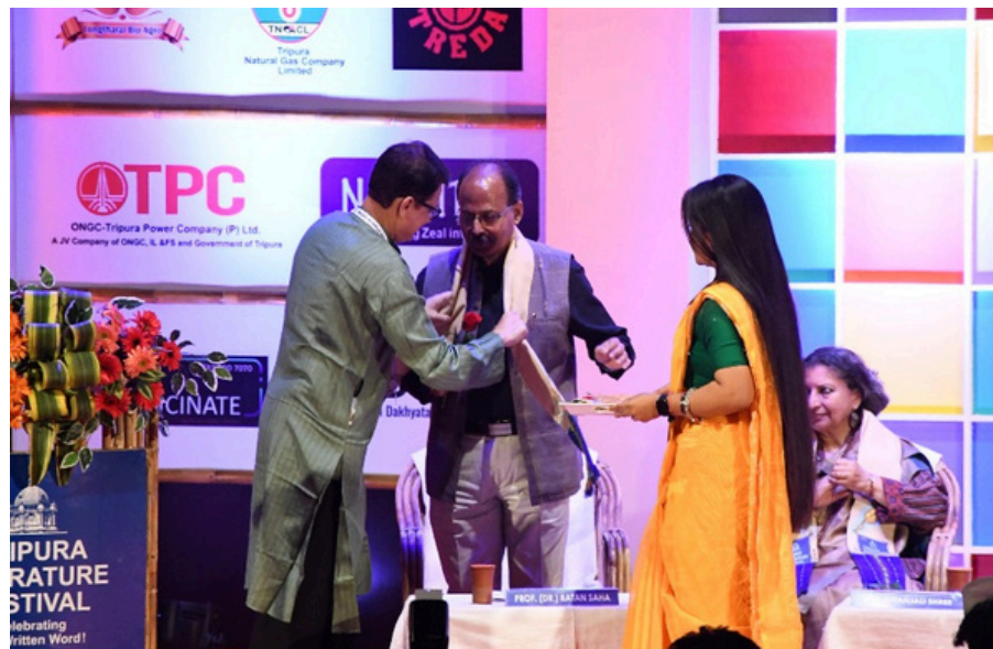
Vice Chancellor TIUT, being felicitated at Tripura LIT-FEST