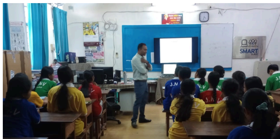
During Interactive Session