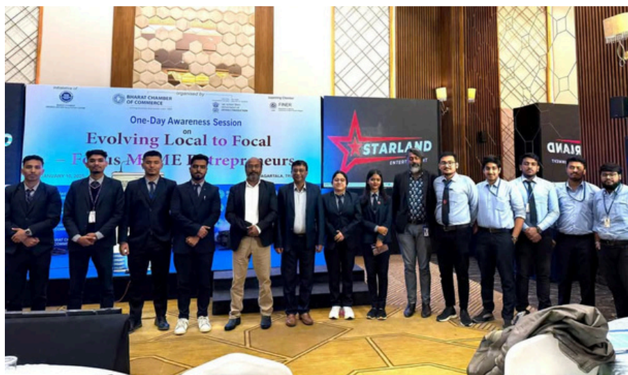
Students from TIUT and TCEA in the event along with faculty guides.

Students actively interacted with experts, showcasing TIUT's commitment to experiential learning and industry collaboration under the leadership of the Hon'ble Vice Chancellor.