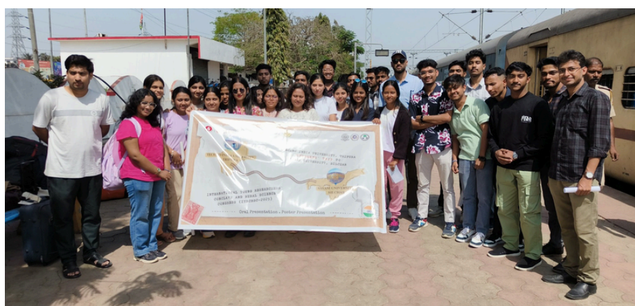
Moments from IYRCSC-2025 visit.