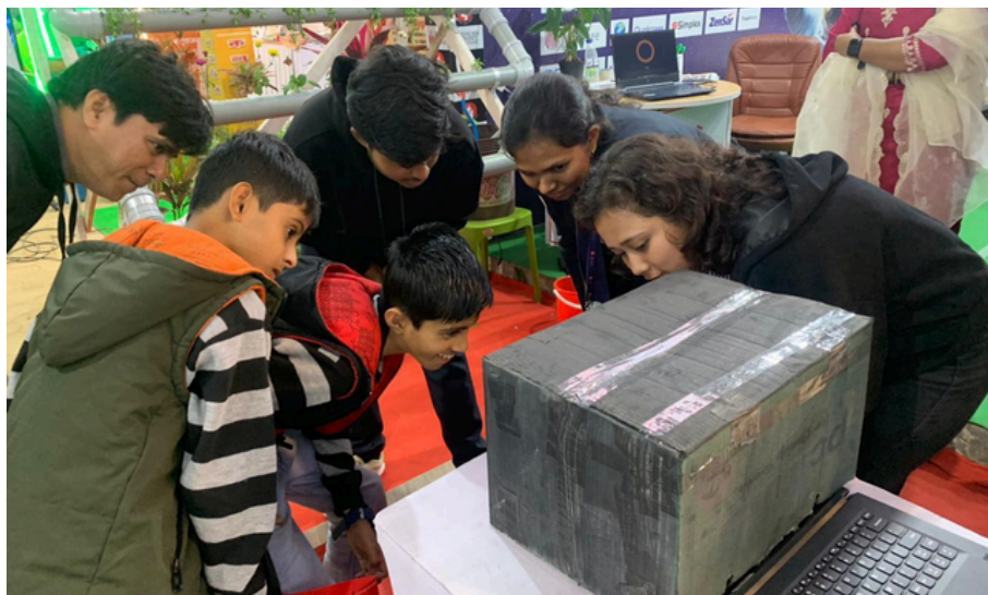
Students from CSE Department with their innovation.

On 9th February, students of the School of Engineering and Technology, TIUT, showcased a Holographic Video Model and a Custom Virtual Assistant at the fair. These cutting-edge projects impressed visitors with their futuristic tech and AI capabilities. The exhibit highlighted our students' creativity and technical skills, reinforcing TIUT's commitment to innovation and excellence in engineering education.