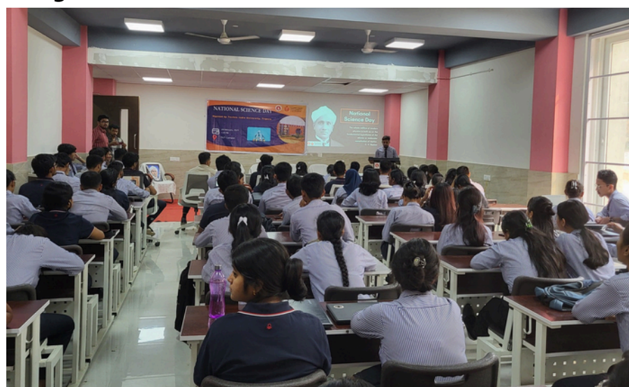
Celebration of National Science Day at TIUT.

TIUT celebrated National Science Day with student presentations, quiz, and speeches, promoting innovation, research, and scientific excellence.