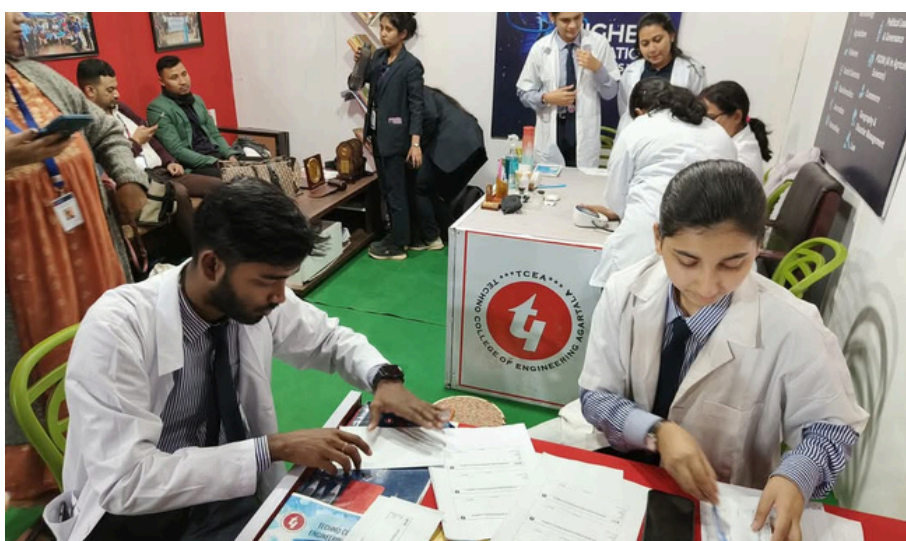
Students of Techno India University Tripura are engaged in helping the faculties and also showing their projects to the visitors.

The stall featured student-led projects, interactive models, and digital demonstrations. Attendees engaged in career-counseling sessions and live discussions with faculty, experiencing TIUT's innovative academic spirit firsthand.