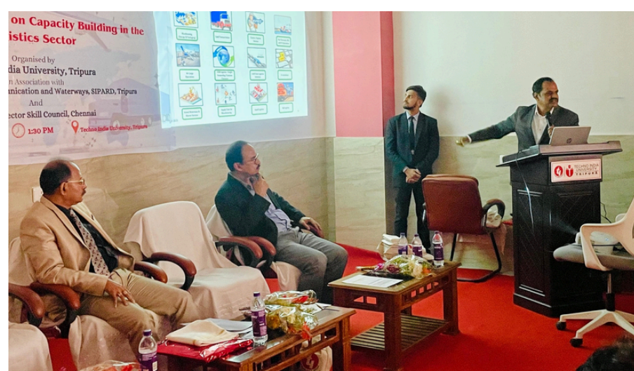
During interactive session