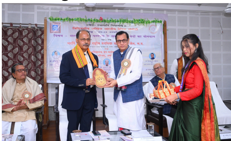
Vice Chancellor TIUT being felicitated at National Conference on Vedic Knowledge