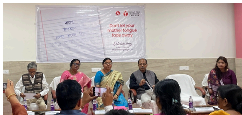
Mother Language Day Celebration