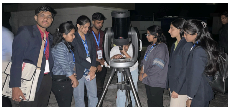
Exciting sky observation session.