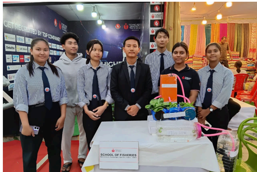
Students of Fisheries Dept along with their project at Tripura Industries and Commerce Fair 2025.

Students from the School of Fisheries, Techno India University, Tripura, showcased their innovative Aquaponics model at the 35th Tripura Industries & Commerce Fair 2025. This sustainable farming approach integrates fish and plant cultivation, promoting eco-friendly agricultural practices.