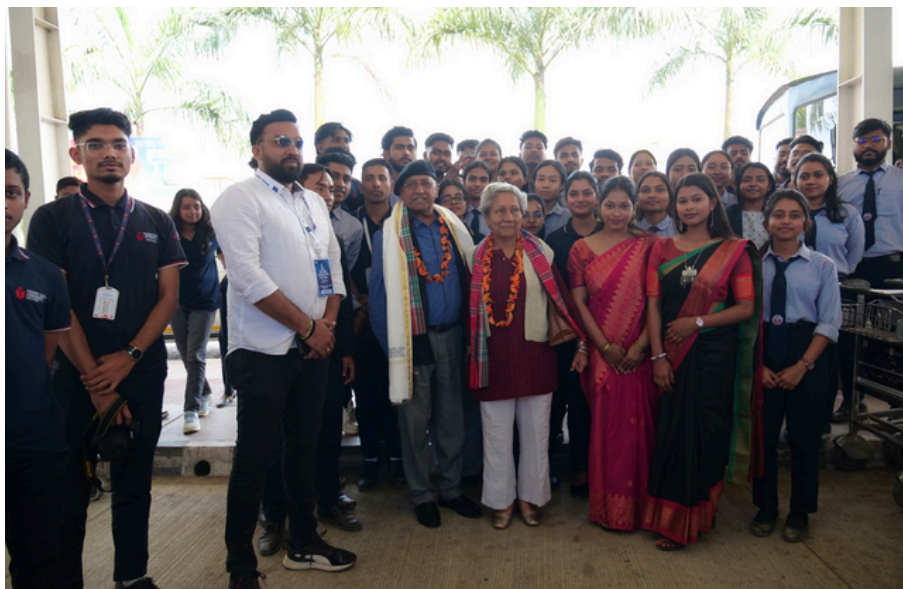
TIUT Students with Wing Commander Rakesh Sharma (Retd.).

On 20th February 2025, Techno India University, Tripura, proudly welcomed Wing Commander Rakesh Sharma (Retd.), India's first astronaut, at Agartala Airport. Students sang "Saare Jahan Se Accha" as a tribute to his historic spaceflight. His visit for the Tripura Literature Festival 2025 inspired all.