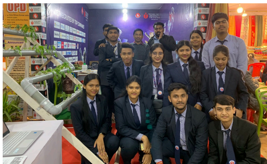
Students from Agriculture Department with their innovation.

Students of the Department of Agriculture, Techno India University, Tripura, presented a vertical hydroponics model titled "Maximizing Urban Space with Vertical Hydroponics" at the 35th Tripura Industries & Commerce Fair 2025.