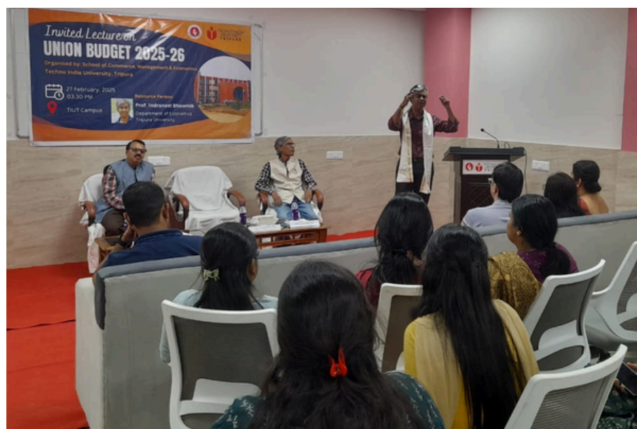
During interactive session