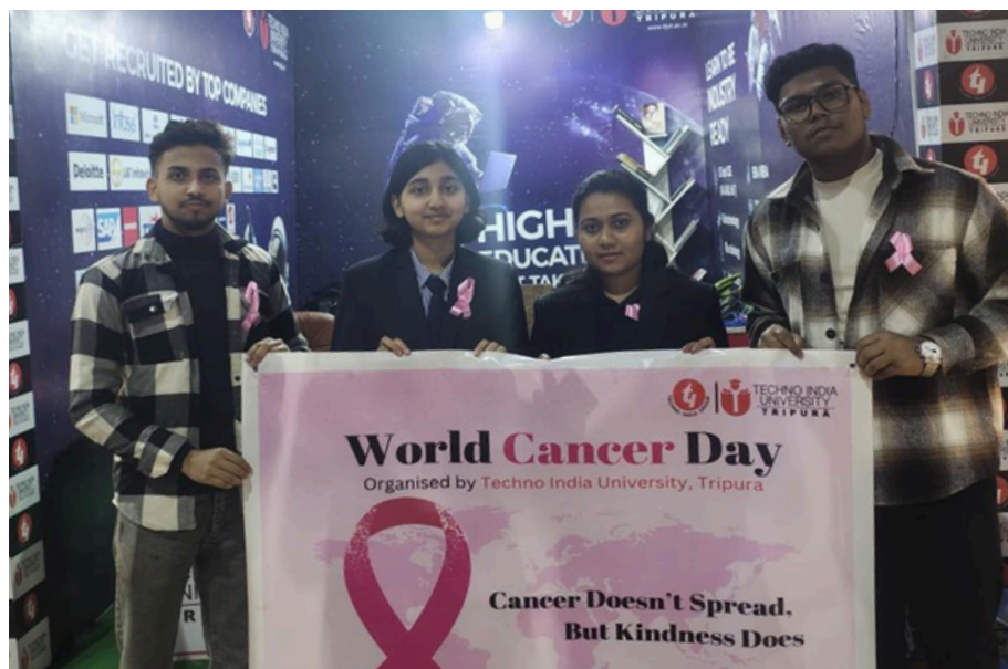
Cancer Day Awareness by the students of TIUT.

On World Cancer Day, students at Techno India University, Tripura, led by the Departments of Microbiology and Biotechnology, organized an engaging quiz competition and informative discussions to raise awareness about cancer prevention, early detection, and healthy living. This initiative highlighted the importance of public health and empowered participants with valuable knowledge to combat cancer and promote well-being.