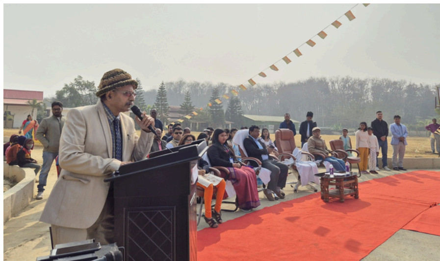
Vice-Chancellor (TIUT) addressing the flag hosting ceremony at TIUT Campus.

On 26th January 2025, Techno India Knowledge Campus celebrated the 76th Republic Day with the theme "Swarnim Bharat – Virasat aur Vikas."