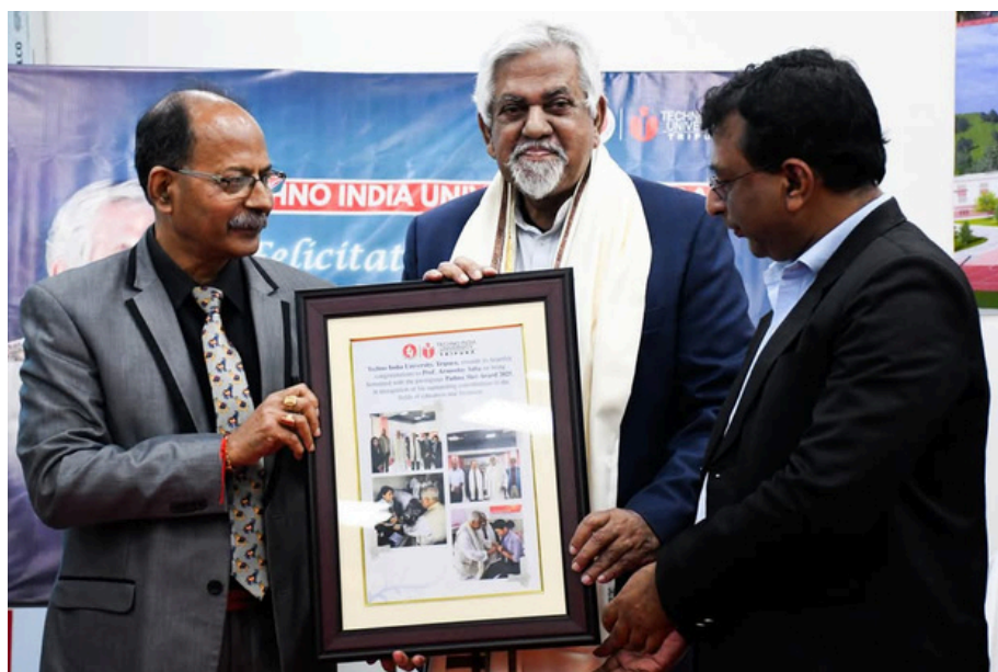
Vice-Chancellor (TIUT) & Principal (TCEA) felicitating him as Chief Guest for the Genius 1.0 Quiz Competition finale.