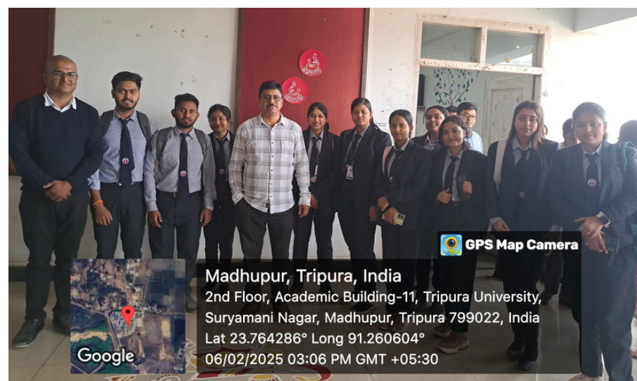
English Dept. students with their faculty on a visit at Tripura University