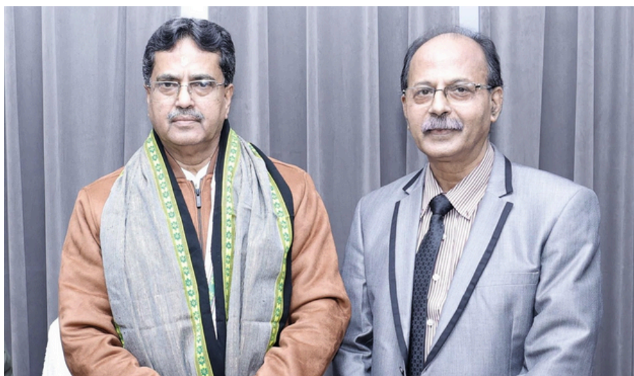
Vice Chancellor TIUT with the Chief Minister.