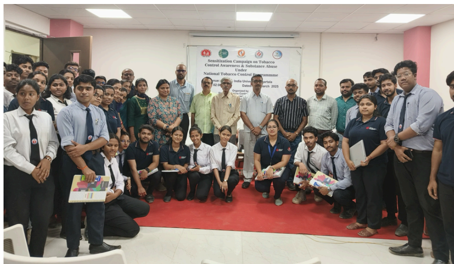
During the interaction session of students with the esteemed guests.

Techno India University, Tripura, hosted a successful awareness programme on 20th March 2025 in collaboration with the District Tobacco Control Cell, NTCP. Experts discussed the health risks of tobacco and substance abuse, followed by an engaging quiz. TIUT remains committed to promoting a healthy, substance-free environment.