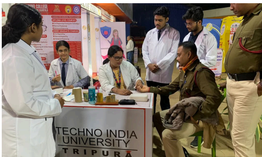
Students & faculties from TIUT & TCEA engaged in conducting the free health checkup camp..

On 11th January 2025, Techno India Knowledge Campus organized a Free Health Camp during the 43rd Agartala Book Fair, offering free health check-ups and medical consultations to visitors. The initiative was led by students from the Departments of Microbiology and Biotechnology, whose active participation contributed to its success and positive public reception.