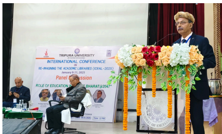
Vice-Chancellor (TIUT) is giving lecture at ICRAL 2025.

On 9th January 2025, the Hon'ble Vice Chancellor of Techno India University, Tripura, participated in a high-level panel discussion on "Role of Education in Viksit Bharat @ 2047" at the International Conference on Re-imagining Academic Libraries (ICRAL 2025). Organized by Tripura University, the event convened global experts to discuss the future of education and libraries in nation-building.