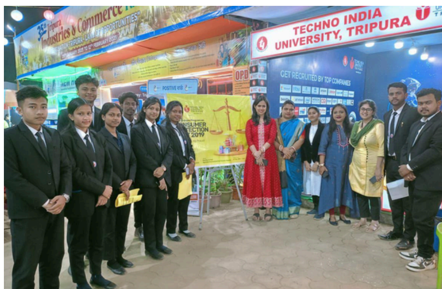
Students participation in Legal Awareness Camp.

On 6th February 2025, Techno India University, Tripura, hosted a Legal Awareness Camp at the 35th Tripura Industries & Commerce Fair. BBA LLB students from the School of Law actively interacted with visitors, raising awareness on consumer rights, responsibilities, and remedies under the Consumer Protection Act 2019. The initiative empowered attendees to make informed decisions and understand legal recourse.